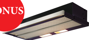
BONUS SLIDEOUT RANGEHOOD 600MM 3CC-236X AUS