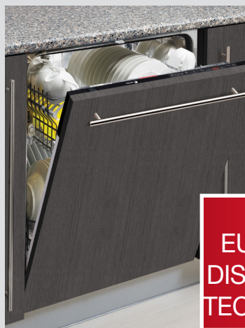
FULLY INTEGRATED DISHWASHER 600MM LF-073IT AUS