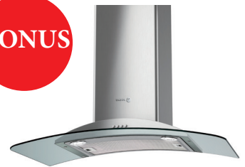
YOUR CHOICE BONUS CANOPY GLASS WALL CANOPY 900MM 6CFT-90V AUS (pictured) 3CFT-9BR SX or 5CFB-90X See Overpage