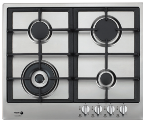
GAS COOKTOP 600MM FI-4GLSTX AUS