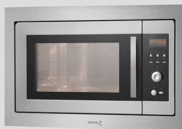
MICROWAVE 600MM MWB-23EGX AUS • With quartz grill