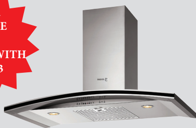
WALL CANOPY 900MM 3CFT-9BRSX