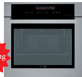
PYROLYTIC / COOKBOOK OVEN 600MM 6H-875ATCX AUS