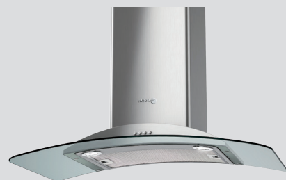
GLASS WALL CANOPY 900MM 6CFT-90V AUS