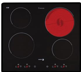
CERAMIC COOKTOP 600MM 2VFT-400S