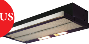
BONUS SLIDEOUT RANGEHOOD 600MM 3CC-236X AUS