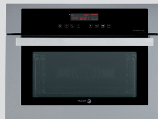
COMBINATION OVEN WITH MICROWAVE 6H-570ATCX • Fan forced oven/grill/microwave