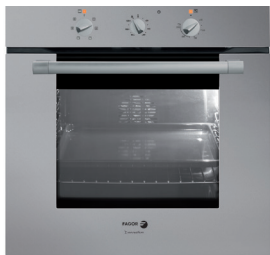
MULTIFUNCTION OVEN 600MM 6H-114X AUS