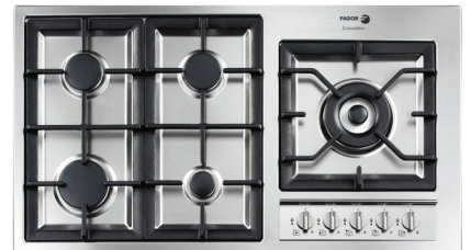
GAS COOKTOP 600MM FI-95GLSTX AUS