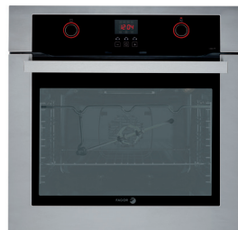
MULTIFUNCTION OVEN 600MM 6H-196AX AUS