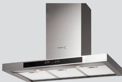
WALL CANOPY 600MM OR 900MM 5CFB-60X AUS & 5CFB-90X