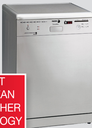
FREESTANDING DISHWASHER 600MM LFF-033XA AUS