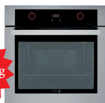
UPGRADE TO PYROLYTIC OVEN 6H-760X AUS FOR $500